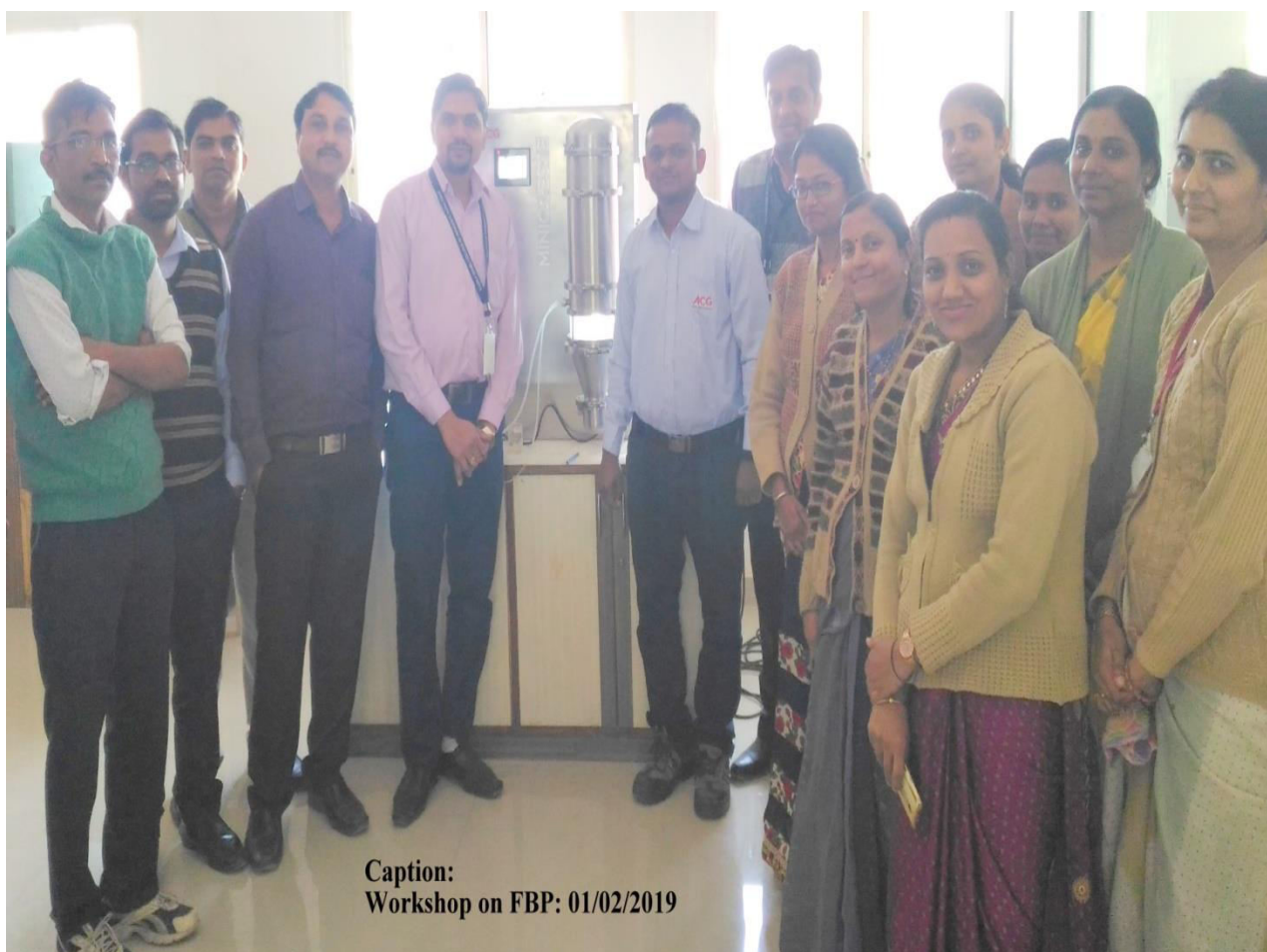
Caption: Workshop on FBP: 01/02/2019