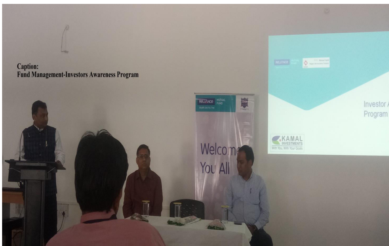
Caption: Fund Management-Investors Awareness Program